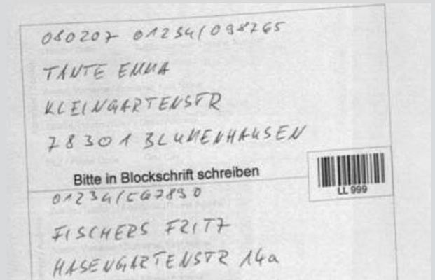
The VIPAC OCR software identifies machine-generated and handwritten address information.

on labels and outer packaging – even under plastic film.