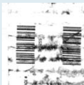
... the code is blurred