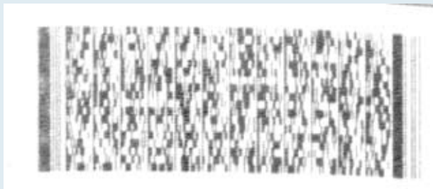
... the print is printed with pale contrast