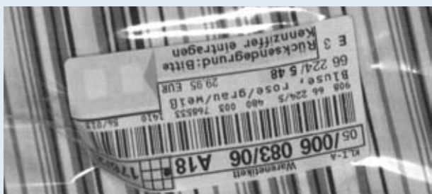
... the code is attached to material with a similar design