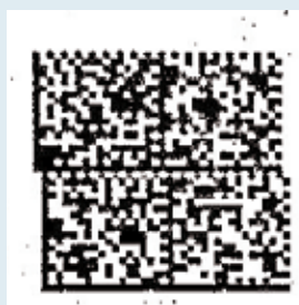
... the code is displaced