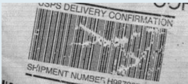
... scratches and partial damages interfere with the print