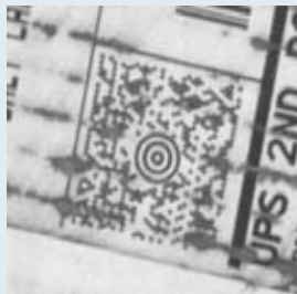
... the code is soiled